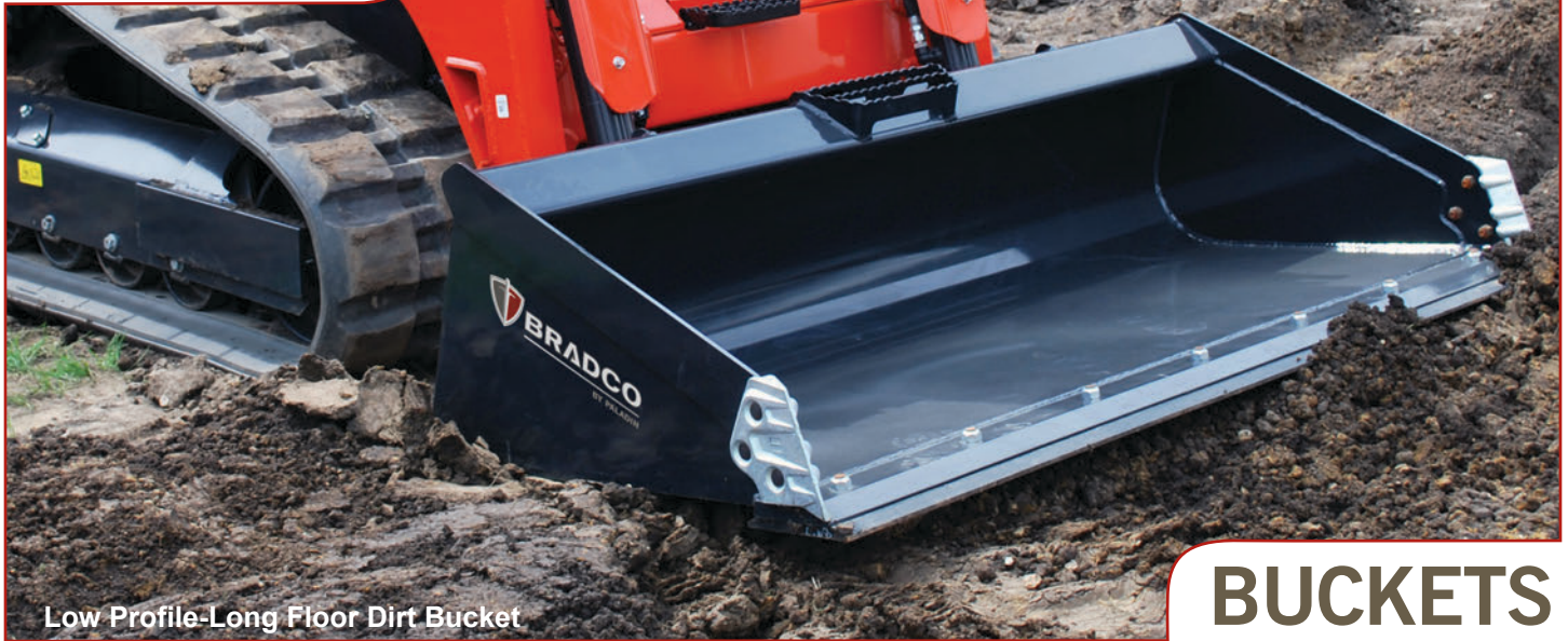
Low Profile-Long Floor Dirt Bucket