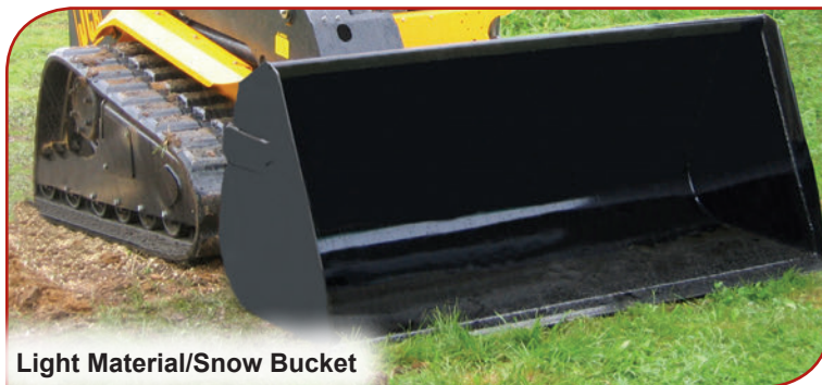
Light Material/Snow Bucket

Paladin Attachments is your single source for high quality attachments for skid steers, compact tool carriers, and excavators used for vegetation/land management, landscaping, soil preparation, material handling, and construction.