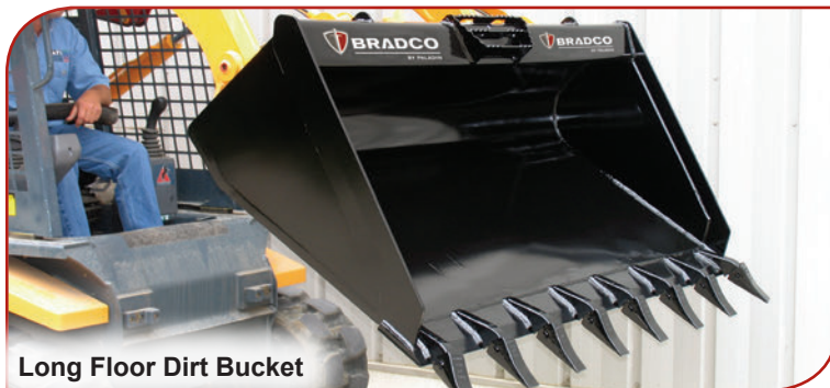
Long Floor Dirt Bucket

Bradco Buckets , by Paladin, are available in many styles, sizes and patterns to fit any need.