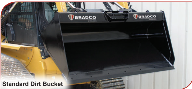
Standard Dirt Bucket